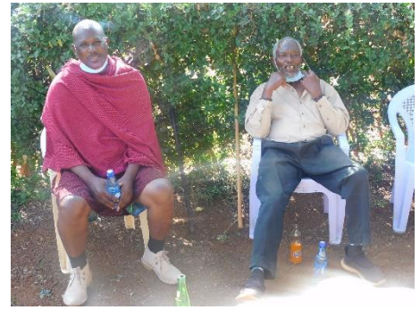
Old and young enjoyed the meal together...