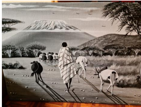
The Bishop gave me a gift of the above painting to remind me that I am a shepherd to the Maasai and my home is here.