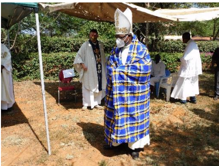
Even the Bishop was given gifts