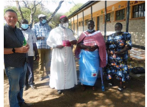
And some even got a photo taken with the Bishop