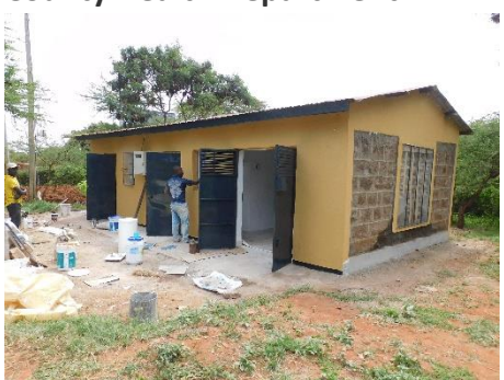
The outside too gets a make over

commissioned a new Water Purification Plant, thanks to a donation received from a group of Irish Dentists, we spent the last month painting and tiling the building in order to bring it to a higher standard required by the County Health Department.