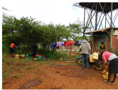
People come to collect water and even do their laundry on the spot.

The primary idea is to have clean drinking water for the locals, but in order to help in the running and financing of the plant a couple of parishioners came up with the idea of bottling the water and selling it to shops. They are in the process of gathering information on how to go about this, so more on this at a later date.