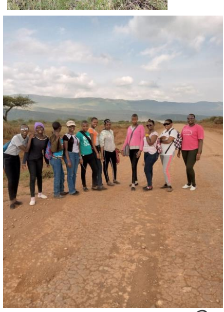
Looks more like a fashion show @

However, as with all the children in the area, they long to get back to school and their old routine.